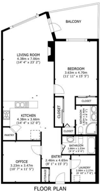
#203-9708 110 ST RIVERVIEW GREEN WIKWENTOWIN, EDMONTON

GROSS INTERNAL AREA FLOOR PLAN: 100.00 m 2 (1,115 sq. ft.) TOTAL: 100.00 m 2 (1,115 sq. ft.) SIZES AND DIMENSIONS ARE APPROXIMATE, ACTUAL MAY VARY