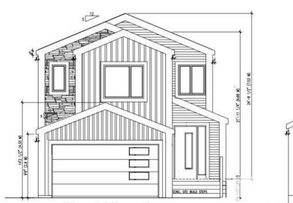
Front Elevation SCALE 3/16"=1'-0"