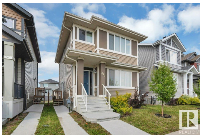
342 W Haven Dr, Leduc, AB

Main Floor Exterior Area 758.36 sq ft Interior Area 696.28 sq ft